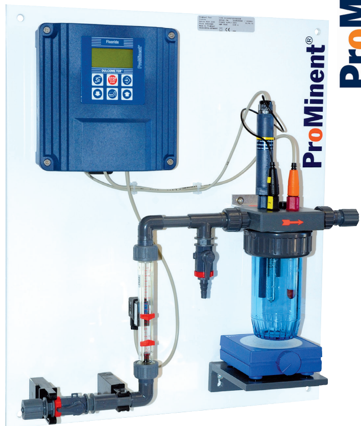
ProMinent® fluoride monitor

Standard unit measures free fluoride with an optional unit available for total.