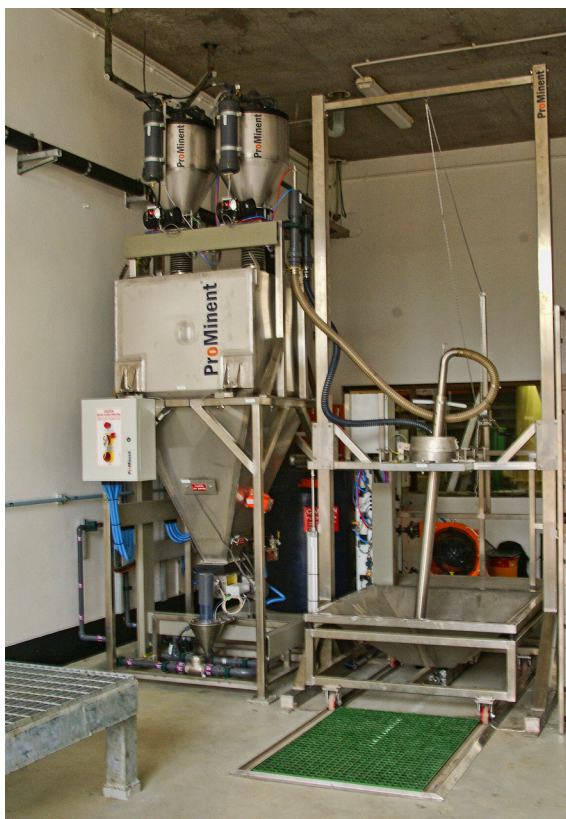
ProMinent® Sodium Silicofluoride 1000 kg bag vacuum load package