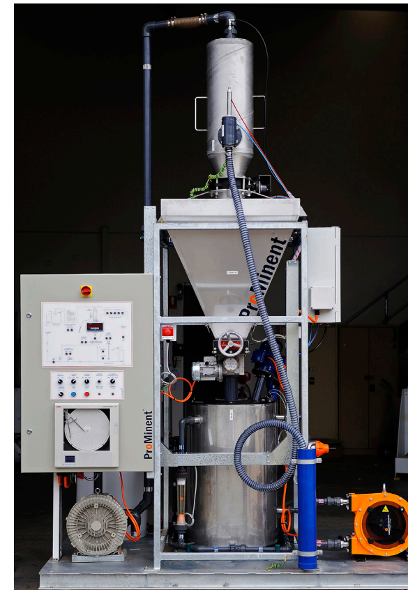
Vacuum load Sodium Silicofluoride package for 25 kg bags

Fluoride solution can be gravity fed or transferred to the injection point via a positive displacement ProMinent® Spectra® progressive cavity pump(s) or a DULCOflex® tube pump(s). In all cases we ensure a 10 minute retention mixing time in the solution tank.