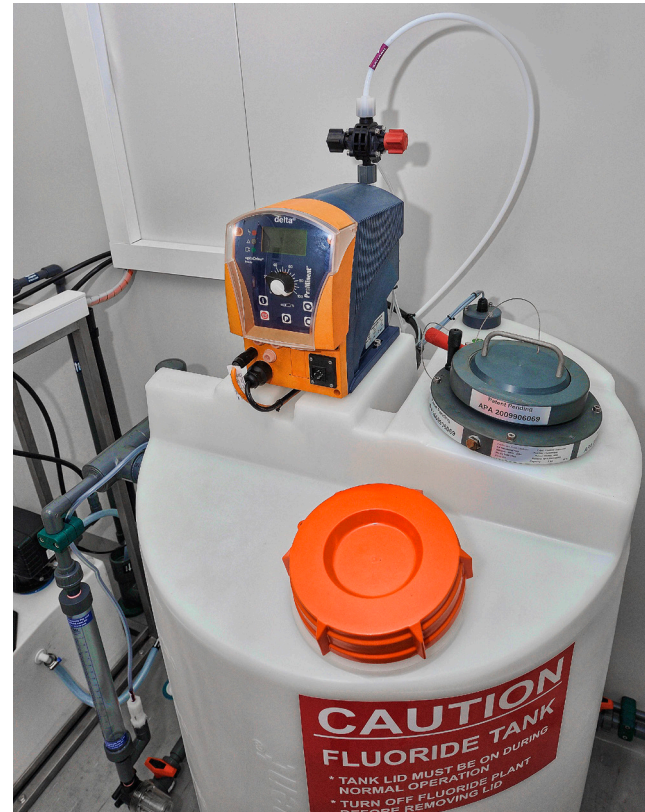
Featuring patented container cutter/loader and water flushing device

For both the above saturators the ProMinent® metering pump displays the total amount dosed. This can be compared daily against the total water flow on the control panel. The metering pump(s) has a monitor to detect if the dosing has stopped and alarm accordingly. Saturators can be installed in client's building or supplied pre-installed in a portable building.